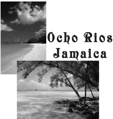
Ocho Rios Jamaica

CARNIVAL FREEDOM: 6 Nights, sailing from Ft. Lauderdale to: Key West, Grand Cayman and Ocho Rios, Jamaica Category & Cabin Prices: Double Occupancy per person: